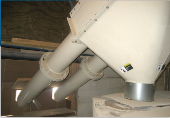
The 40 ft (12.2 m) tubular drag discharges pellets into the packaging hopper. Accumulated dust from the former rubber belt conveyor sits on top of the packaging hopper.