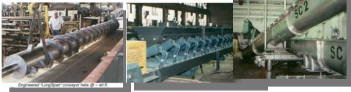
Engineered "LongSpan" conveyor helix @ 40 ft

J.D.B. DENSE FLOW INC. DENSE FLOW PNEUMATIC CONVEYING SYSTEMS